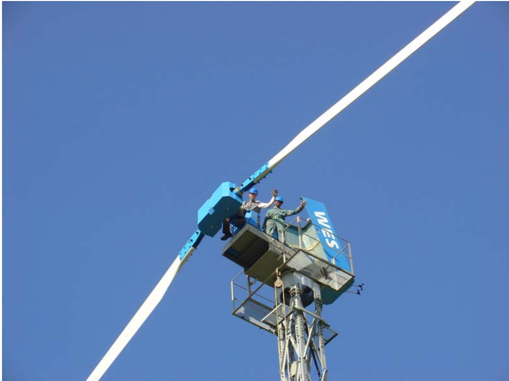
Successful installation on Nusa Penida island, Indonesia.