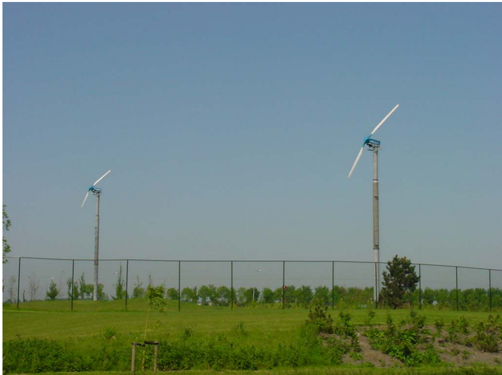
2 x WES 18 next to a golf course, the Netherlands.