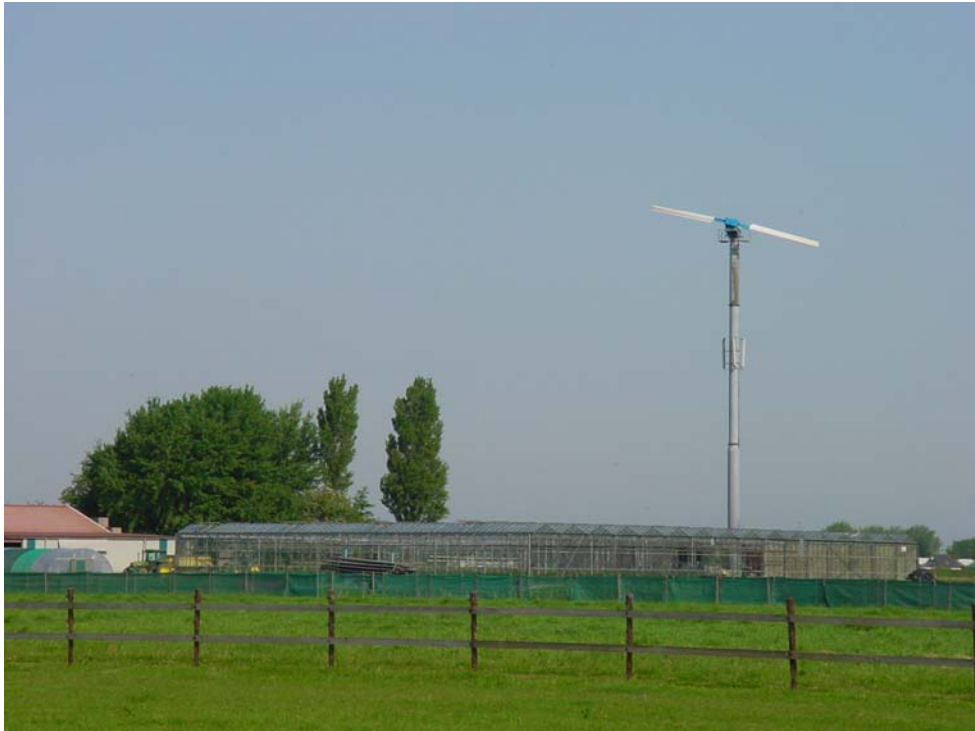
WES 18 (with GSM transmitter) at a flower bulb business, the Netherlands.