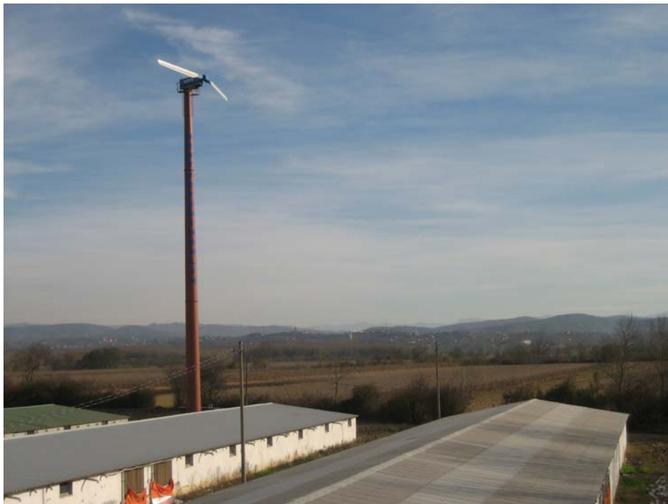
WES 18 at a poultry farm, Ferizle, Turkey.