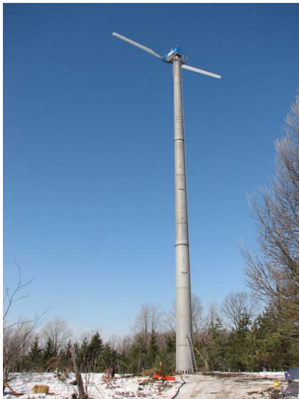
WES 18 in Ontario, Canada.