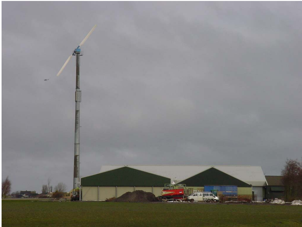
WES 18 at a farm, the Netherlands.