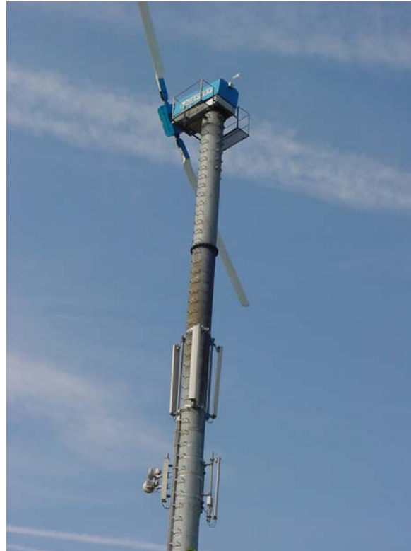
GSM transmitters on a WES 18 .