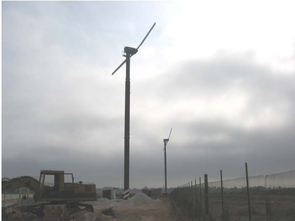
2 x WES 18 at shrimp processing facility, Tangiers, Morocco.