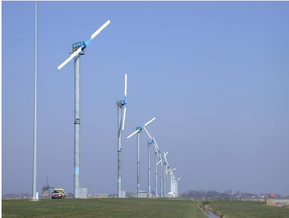
WES 18 wind farm, the Netherlands.