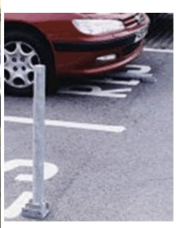
HINGED PARKING POST 900mm above ground, 60.3mm diameter. Available Hot Dip Galvanised or Polyester Powder Coated.